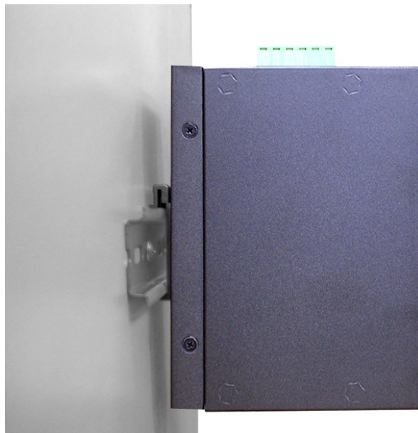
Fig. 4: Installation to DIN-Rail Step 2