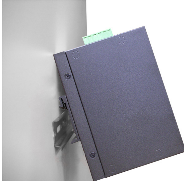
Fig. 3: Installation to DIN-Rail Step 1